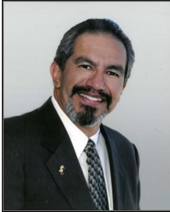
Mayor Ralph Rubio